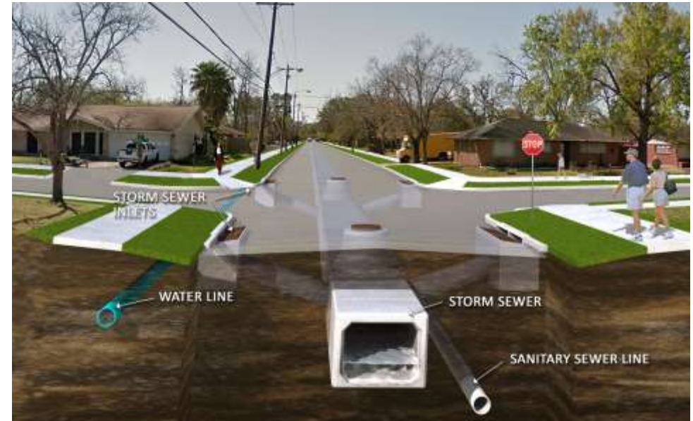
ILLUSTRATION FOR EDUCATION PURPOSES ONLY