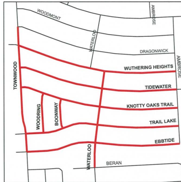
VICINITY MAP - AREA 1 KEY MAP GRID 572K GIMS TILE 5252D COUNCIL DISTRICT K

Replacement of distribution mains and upgrades to small water line pipes that do not meet standards. The project will improve water quality, capacity, and system reliability.