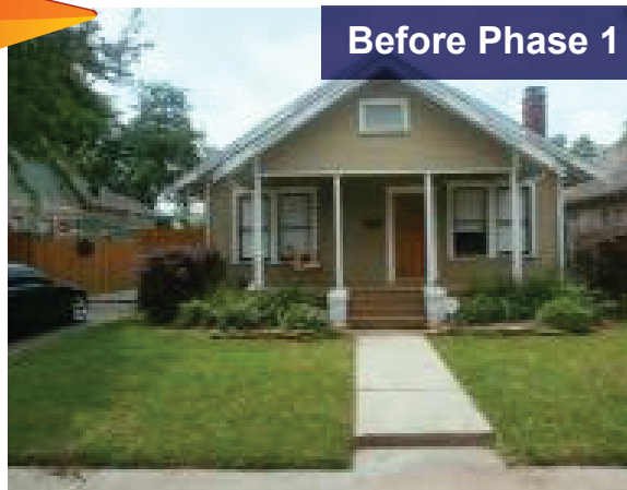
Before Phase 1