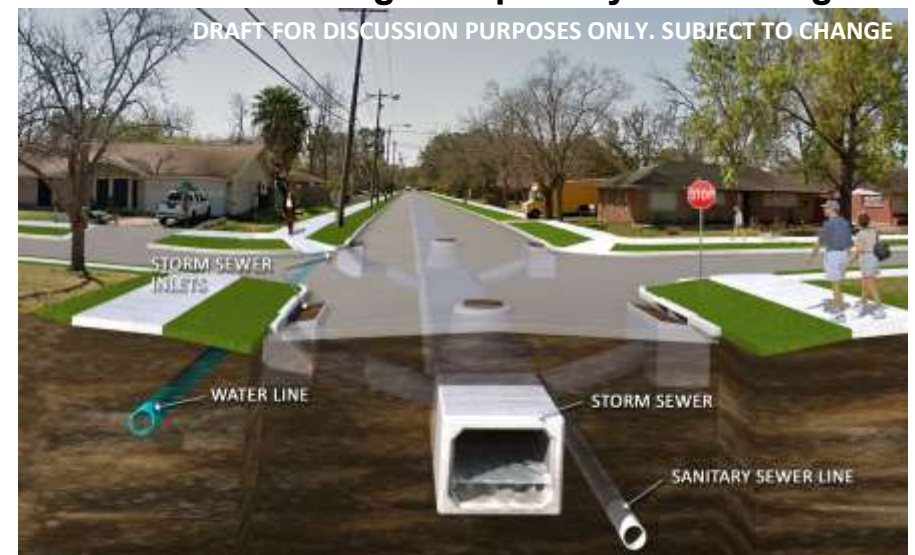
ILLUSTRATION FOR EDUCATION PURPOSES ONLY

Contact us at: info.rebuildhouston@houstontx.gov