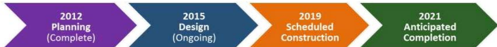
Timeline Subject to Change

Providing input on or before August 29, 2016 allows us to stay on schedule