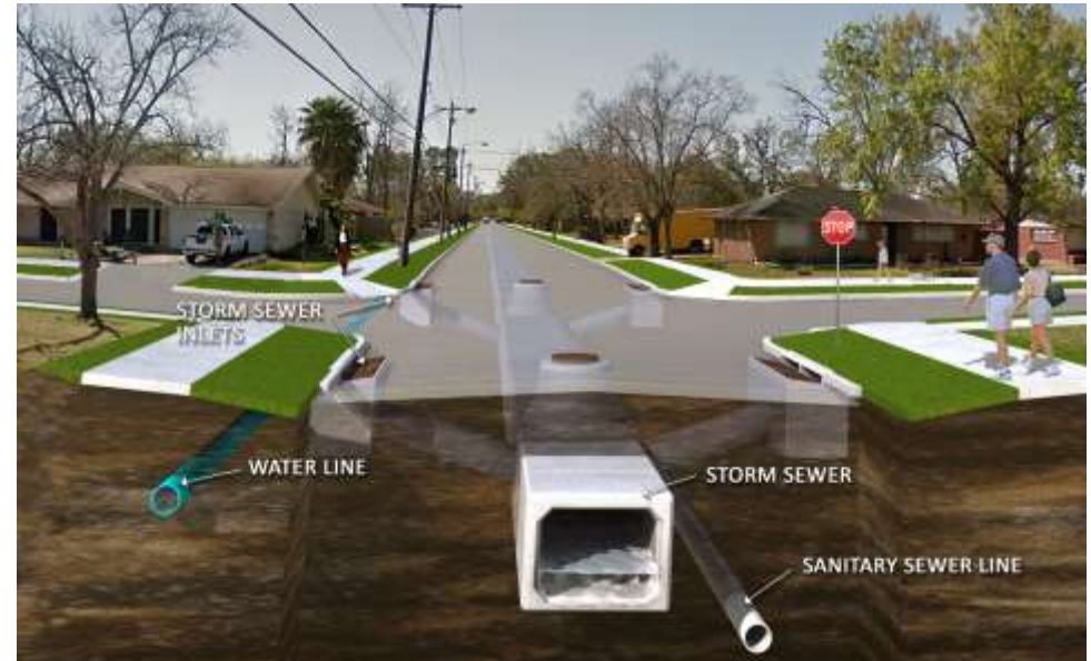
ILLUSTRATION FOR EDUCATION PURPOSES ONLY