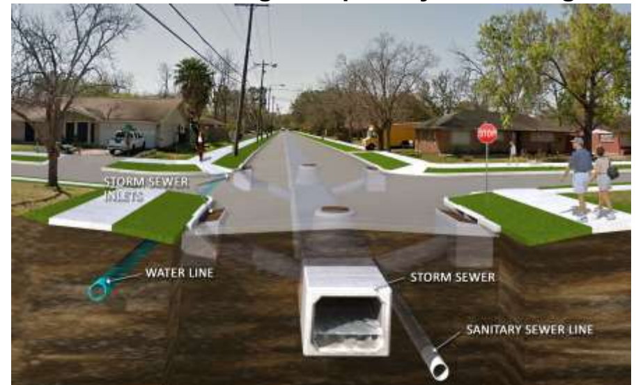
ILLUSTRATION FOR EDUCATION PURPOSES ONLY

What are we doing to improve your drainage?