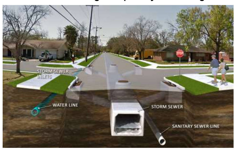
ILLUSTRATION FOR EDUCATION PURPOSES ONLY