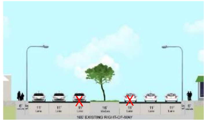
* TYPICAL CROSS SECTION