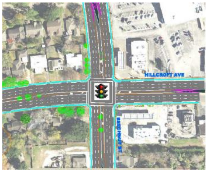
BEECHNUT AND HILLCROFT