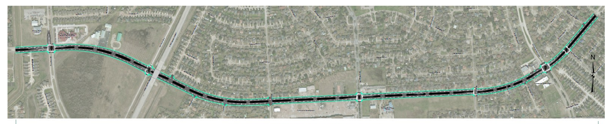
FROM MISSOURI CITY LIMITS TO BAZEL BROOK

Located in southwest Houston and City Council District K, West Fuqua Street Project (CIP number N-100025) is scheduled to be reconstructed from the City Limits to Bazel Brook, approximately 1.9 miles in length. The project will design and reconstruct a 4-Lane divided concrete roadway and street lighting. Sidewalks will be rebuilt to ADA compliance. Additionally, underground water, sewer and storm sewer pipes will be replaced as necessary.