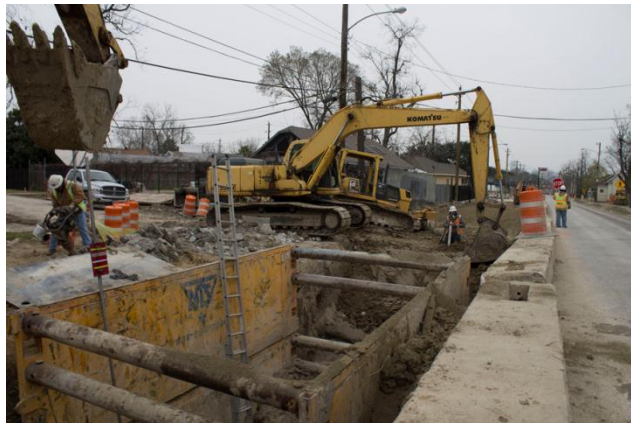
N. Main Reconstruction Project

ReBuild Houston is a voter initiated and approved Pay-As-You-Go, long-term initiative to address street and drainage infrastructure needs in a systematic, prioritized and objective manner. ReBuild Houston is a subset of the City’s legacy 5-Year CIP specific to streets and drainage. At the same time, it is an extension of the CIP providing a 10-year planning process for our street and drainage systems. This initiative allows the City to pro-actively mitigate the degradation of our infrastructure and focus on the areas of highest need or ‘worst first’.