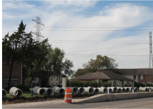
Beechnut Reconstruction Project

ReBuild Houston is not a ‘quick fix.’ The reality of Houston’s drainage and street infrastructure is that it has been inadequately funded for more than 30 years. ReBuild Houston addresses this problem by providing a reliable, long-term funding stream that will free the City from the restraints of mounting debt. Pre-ReBuild Houston debt totals approximately $1.7 billion and costs more than $150 million per year in debt service. Debt is a primary source of infrastructure funding in the United States but the City of Houston is setting a new trend. As the City pays down the old bonds, the number of street and drainage projects paid for in cash will increase dramatically.